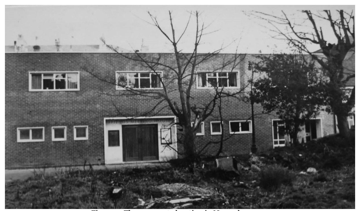
Figure 4: The new west elevation in November 1952