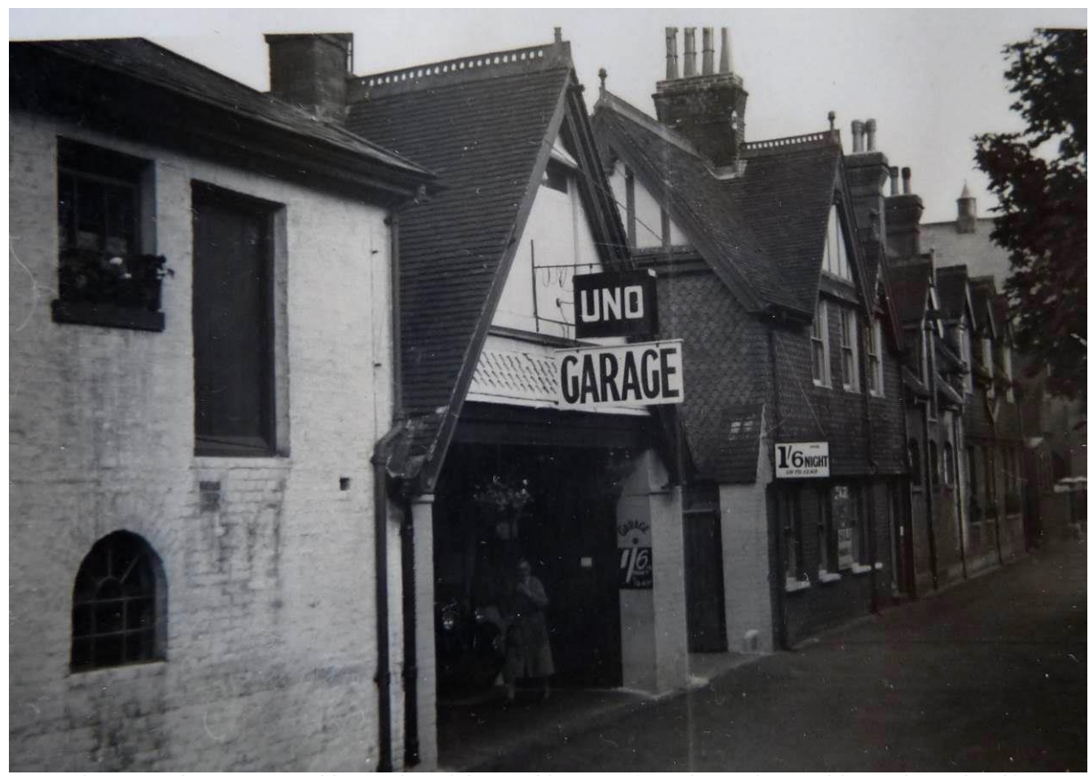
Figure 1: The garage and house in Wish Road in 1938

During the Second World War and particularly during April 1943, the meeting house and the cottage sustained severe bomb damage. In 1951-2, the meeting house and cottage were partially rebuilt by the architect H. Hubbard Ford (builders: G. Gower & Sons). The entire west front was rebuilt as a two-storey flat-roofed block which included a first-floor flat (Figure 4). The eastern part of the meeting room, the courtyard and the children's room remained largely unaltered.