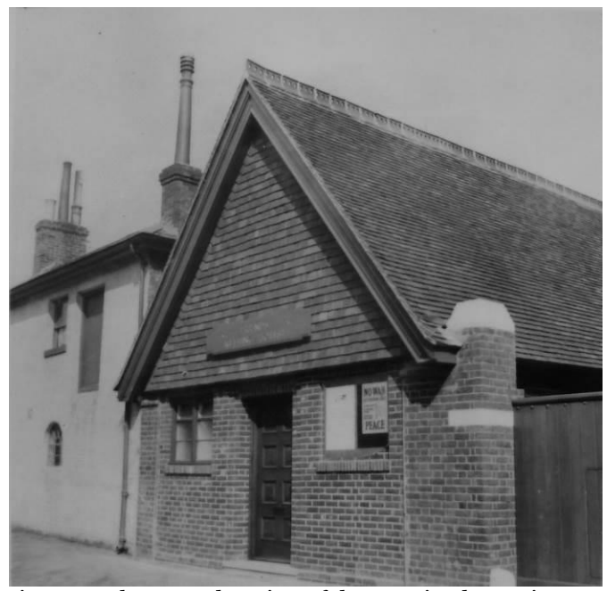
Figure 3: The west elevation of the meeting house in 1939 (Local Meeting archive, minute book)